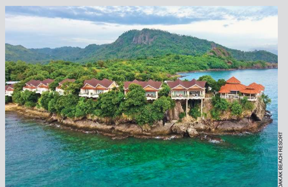
An aerial view of Dakak Beach Resort in Zamboanga del Norte on the southern Philippine island of Mindanao

As the use of virtual currency transactions in the Philippines continues to grow, NOAH Coin is leading the way in spurring economic growth in Mindanao through tourism and agriculture. ■