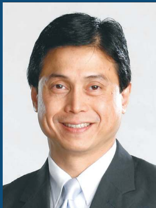
NOAH ARK TECHNOLOGIES

Many central banks around the world are looking at the emergence of blockchain technology favorably, stating that it may help a country's banking sector reach unbanked sectors and fuel economic growth. It is this technology from which platforms are built to exchange digital currencies.