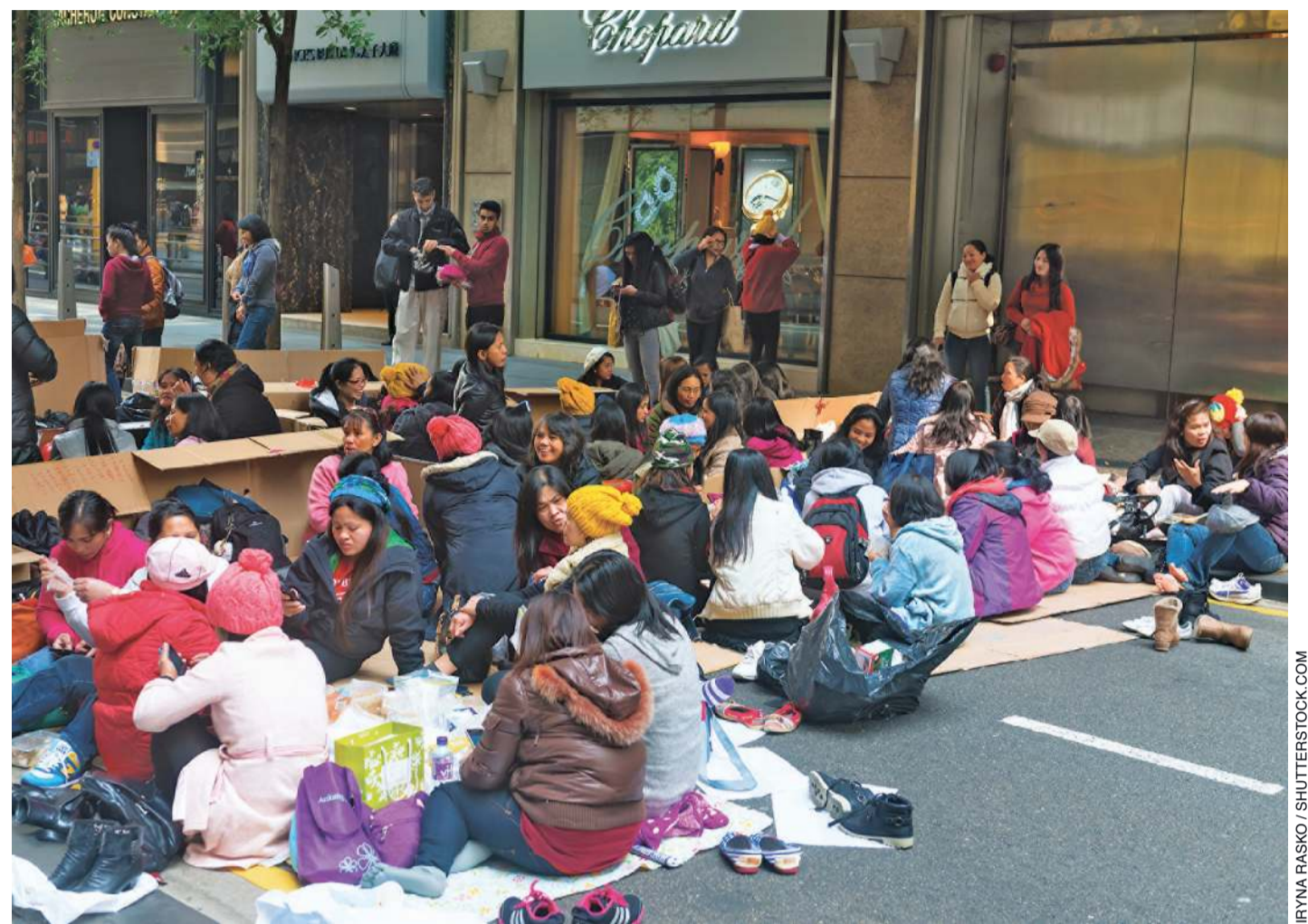
Filipino domestic helpers in Hong Kong. Hailed locally as the bagong bayani (modern day heroes), millions of overseas Filipino workers or OFWs have been huge contributors to the development of the Philippine economy. Remittances to their families account for around 10 percent of the country's gross domestic product. Cryptocurrencies as a medium for remittances is seen as a huge help because they will eliminate high transaction costs to send money to their cash-strapped families.

The project will soon allow Filipinos in Japan to remit money back home using an electronic wallet provided by SCI, a Filipino blockchain service provider, and their Japanese partners. According to the NOAH Coin website, the new platform can