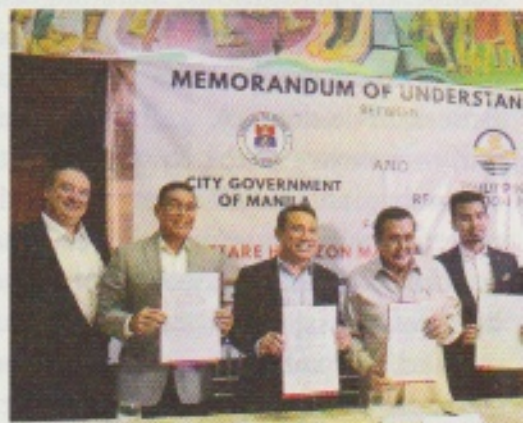
Mayor Joseph Ejercito Estrada (4th from left) and representatives of the City of Manila and J. Bros Construction Corporation signing the Memorandum of Agreement to build Horizon Manila, a 419 hectare reclaimed development in Manila Bay

Through this partnership, any OFW in Japan can exchange Japanese yen for Noah Ark Coins and add them to their Noah Ark Coin-enabled wallet (developed by SCI) via a terminal in any store that offers Nippon Pay services. Right there, the OFW can transfer his Noah Ark Coins to the wallet of their families back home with no service fees incurred. On the other end, their families can exchange Noah Ark Coins to Philippine pesos, which they can deposit to or withdraw from their local bank accounts. Additionally, they can pay for their mobile