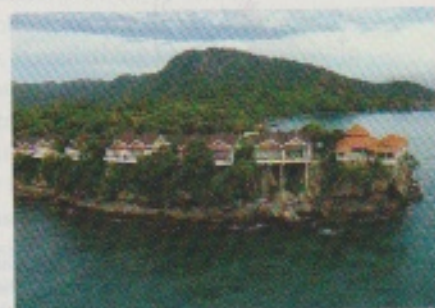
Dakak Beach Resort in Zamboanga del Norte

While it is known for having many of the country's most beautiful beaches, Mindanao is not first-in-mind when it comes to tourism. Among the first resorts to market itself to luxury travelers, Dakak Beach Resort is just a 30-minute car ride away from Dipolog Airport and located in picturesque and historic Dapitan City.