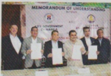
Representatives from Horizon Manila meet with Manila Mayor Joseph Estrada (4th from left) to formalize the creation of a sprawling development on reclaimed land in Manila Bay.

Using the model in Japan as a prototype, the Noah Project wants to build infrastructure that will allow Noah Ark Coins to be exchanged for any of the world's currencies eventually.