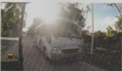
A Noah Resorts bus sits at the ready for guests in Dakak Beach Resort in Zamboanga del Norte.